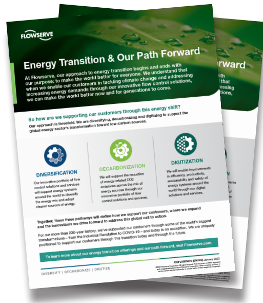
Read Flowserve's approach to energy transition .

Through projects like this, Flowserve demonstrates its leadership in critical energy transition initiatives. We leverage our 225 years of flow control experience and a comprehensive portfolio of product and service solutions so our customers can diversify their energy mix, decarbonize their operations, and digitize their plant processes. As a partner, Flowserve enables companies to enhance operational efficiency and supports their energy transition goals.