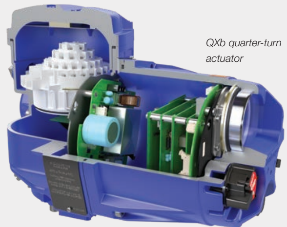
QXb quarter-turn actuator

The MXb/QXb HART field unit interface board is installed in the actuator controls compartment, permitting the actuator to be controlled by a DCS or other network host over the HART network.