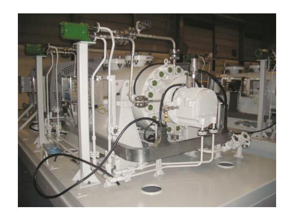
Figure 3: HDO-type pump