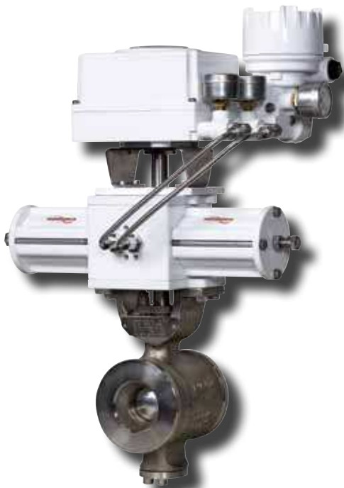
Valtek ShearStream SB

effective continuous operation. They have an extremely long life span as all parts are of highest quality. And they'll still be safe in the future as they use advanced technology and innovative solutions. Flowserve ensures a safe and cost-effective operation for our customers all over the world