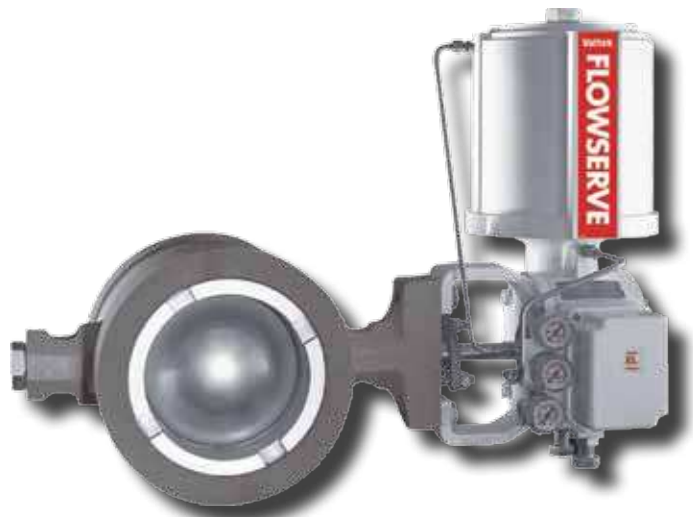
Valtek ShearStream HP