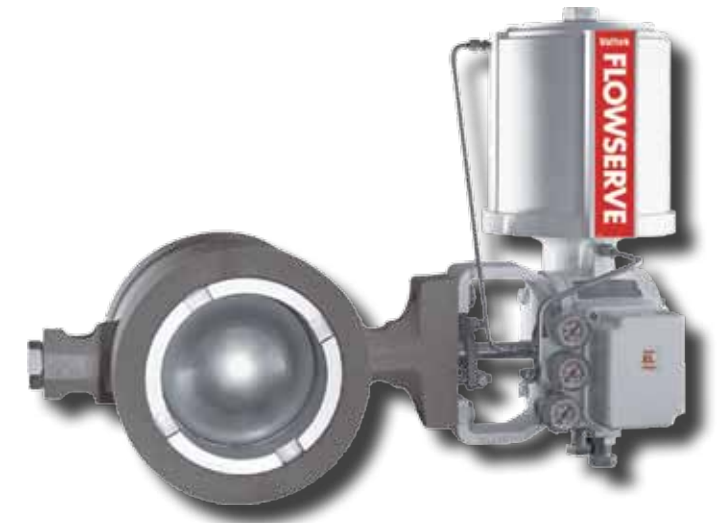
Valtek ShearStream HP

effective continuous operation. They have an extremely long life span as all parts are of highest quality. And they'll still be safe in the future as they use advanced technology and innovative solutions. Flowserve ensures a safe and cost-effective operation for our customers all over the world